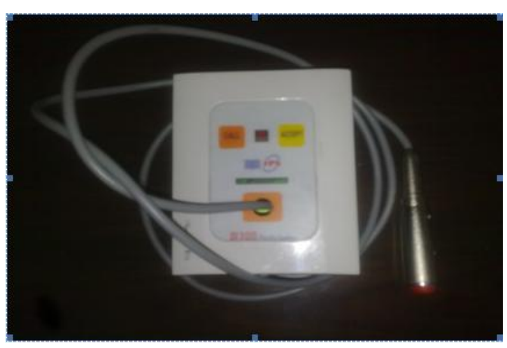
Electronic Touch Pad

Power Button: Pressing this for long time (approximately 3 sec) turns the device ON or OFF.